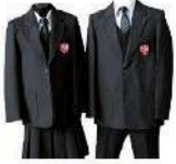
BLAZER WHITE SHIRT, TROUSERS OR SKIRT