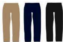
BEIGE, BLUE OR BLACK CHINOS (NO JEANS)