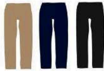
BEIGE, BLUE OR BLACK CHINOS (NO JEANS)