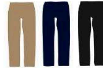
BEIGE, BLUE OR BLACK CHINOS (NO JEANS)