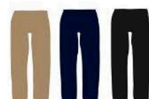
BEIGE, BLUE OR BLACK CHINOS (NO JEANS)