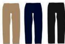
BEIGE, BLUE OR BLACK CHINOS (NO JEANS)