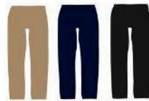
BEIGE, BLUE OR BLACK CHINOS (NO JEANS)