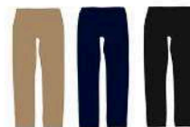
BEIGE, BLUE OR BLACK CHINOS (NO JEANS)