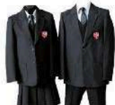
BLAZER WHITE SHIRT, TROUSERS OR SKIRT