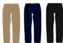
BEIGE, BLUE OR BLACK CHINOS (NO JEANS)