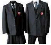
BLAZER WHITE SHIRT, TROUSERS OR SKIRT